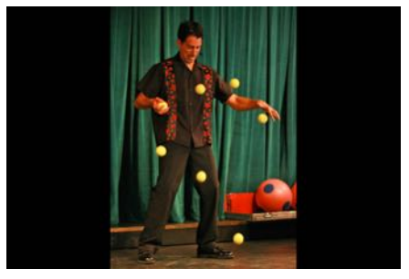
A ridiculous display of world-class dexterity with up to seven rubber balls at once.