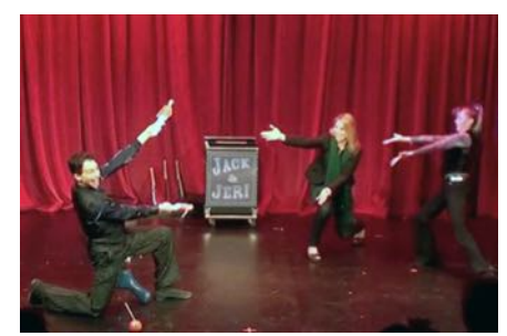
Giving the public what they want to see - something stupid and dangerous! Accompanied by the obligatory lovely assistant.