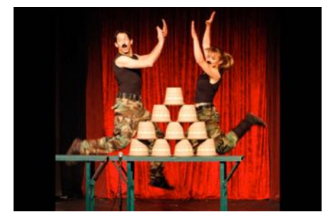
Hilarious, impressive, and unique. This is teamwork at it's most absurd. Performed on numerous TV shows around the world.