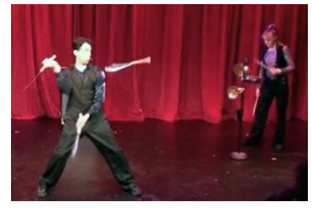
Wake up the audience and keep them on their toes with some fun interaction, culminating in a thrilling knife juggling stunt.