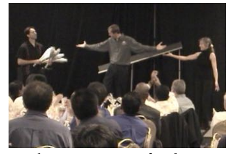
Imagine two jugglers flinging clubs within inches of your body. One brave volunteer signs up for the experience ...and returns a hero.